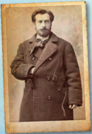
Frederic Auguste Bartholdi visited the United States and chose the place where the Statue of Liberty would stand.